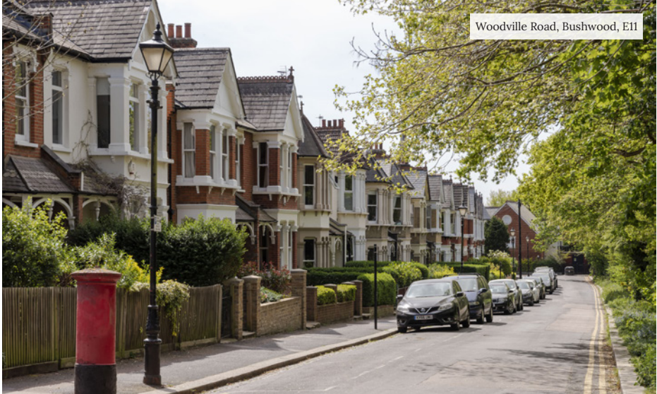
Woodville Road, Bushwood, E11